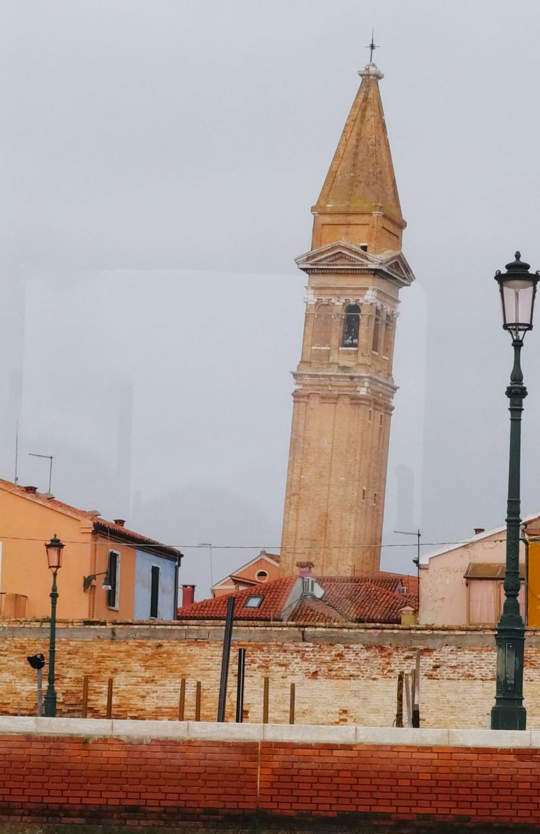
The leaning tower of Burano